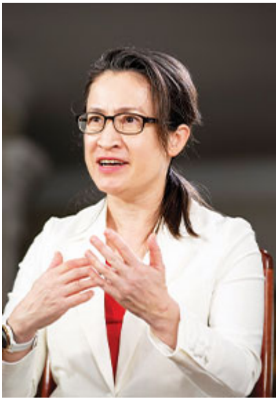
Bi-khim Hsiao

Published in the February 27, 2023 issue of the New American magazine. Vol. 39, No. 04