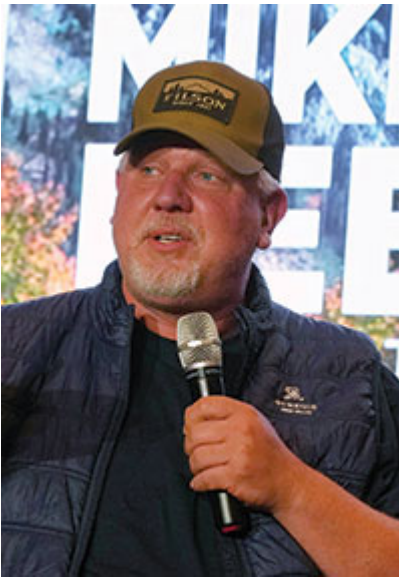
Glenn Beck

Published in the October 31, 2022 issue of the New American magazine. Vol. 38, No. 20