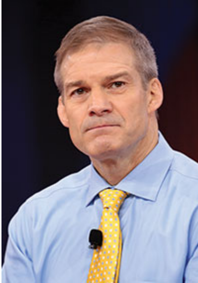
Jim Jordan

"Call me extreme if I want stable prices, affordable energy, and a secure border. But think about this: In the past four weeks, Joe Biden has raided the home of a former president, taken the phone of a sitting member of Congress, called one half of the country fascist and extremist, and said to those same people 'by the way we're going to make you pay the student loan debt of someone else.' And, finally, he signed a bill to unleash 87,000 additional IRS agents to come harass you, the American taxpayer. Such a deal!"