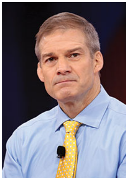
Jim Jordan

“Call me extreme if I want stable prices, affordable energy, and a secure border. But think about this: In the past four weeks, Joe Biden has raided the home of a former president, taken the phone of a sitting member of Congress, called one half of the country fascist and extremist, and said to those same people ‘by the way we’re going to make you pay the student loan debt of someone else.’ And, finally, he signed a bill to unleash 87,000 additional IRS agents to come harass you, the American taxpayer. Such a deal!”