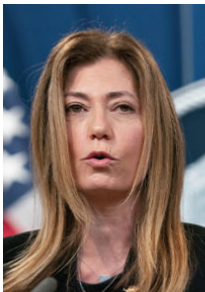
Anne Milgram

Published in the September 26, 2022 issue of the New American magazine. Vol. 38, No. 18