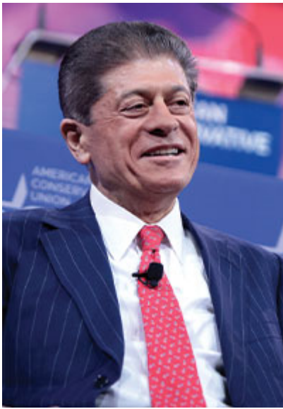
Andrew Napolitano

Published in the September 12, 2022 issue of the New American magazine. Vol. 38, No. 17