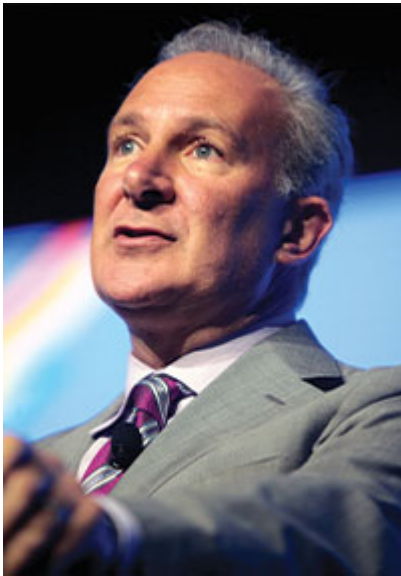
Peter Schiff

"I think the economic weakness [of the United States] is going to be so pronounced over such a long period of time that it would not even do it justice to call it a recession. I think depression is going to be a more accurate description of what we're going to go through. Prices are going to rise much more in this decade than they did in the 1970s."