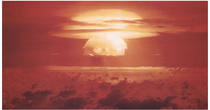
US Department of energy US Department of energy

In the late 1980s, as former adversaries were morphed virtually overnight into cooperative compatriots,