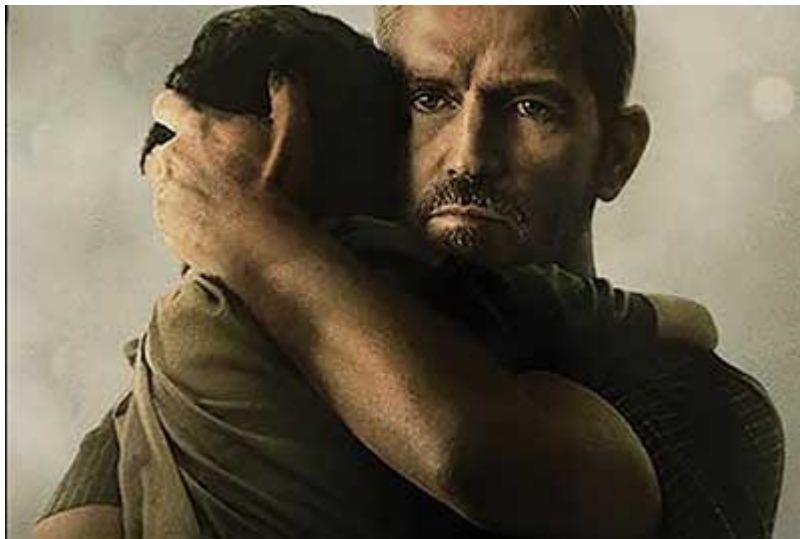
Sound of Freedom movie poster.