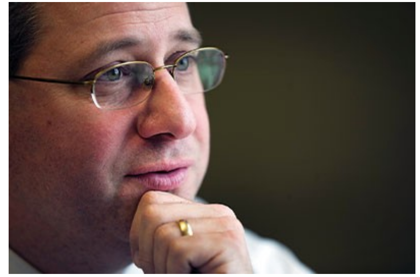
Federal Election Commission Chairman Trey Trainor called the 2020 election "illegitimate" due to massive voter fraud across America.

At this point, virtually anybody who is not depending on the fake-news media as their only source of information can see the fraud clearly. Despite Fox News tipping its hand and trying to play along with the fraud, a poll from Politico showed that by the week after the election, well over two-thirds of Republican voters did not trust the outcome, with the numbers continuing to grow. By November 10, a poll by Rasmussen showed less than half of likely voters believed Biden won the election. Trump supporters are now rallying nationwide by the millions against the "Big Steal."