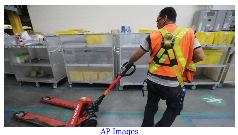
Federal overreach: OSHA cited Amazon last year for failing to properly record workplace injuries per agency dictates.

These agencies have built up a large body of administrative law which the people are obliged to obey. And not only do they make their own laws; they enforce their own laws, acting as prosecutor, jury and judge; an appeal from their decisions to the regular courts is difficult.... Thus the Constitutional separation of the three governmental powers, namely, the legislative, the executive and the judicial is entirely lost.