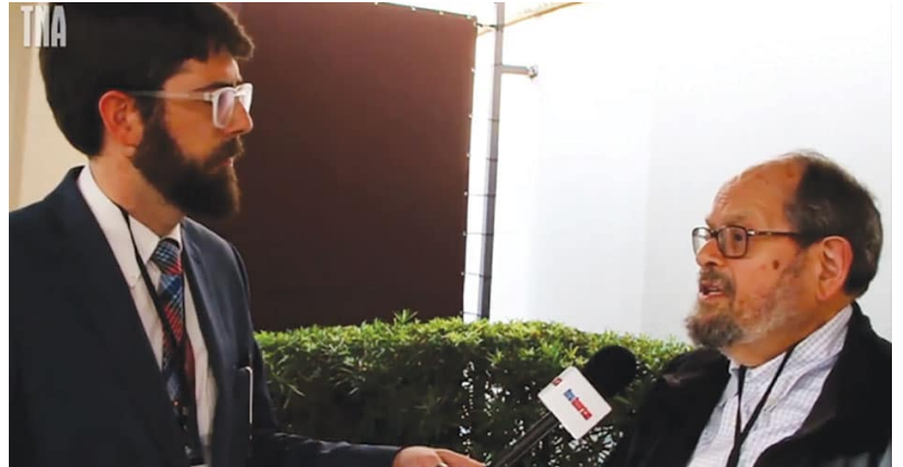
The New American

ORLANDO, Florida — So-called climate policies by governments and Big Business, not alleged man-made climate change, are leading the world toward catastrophe on multiple fronts, warned leading scientists and policymakers from across the United States and beyond. Gathered at the Heartland Institute's 15th International Conference on Climate Change, this broad coalition of more than 50 experts sounded the alarm on man-made crises ranging from energy and food scarcity to economic devastation and even tyranny unleashed under environmental pretexts. A dozen of them spoke with The New American magazine about it.