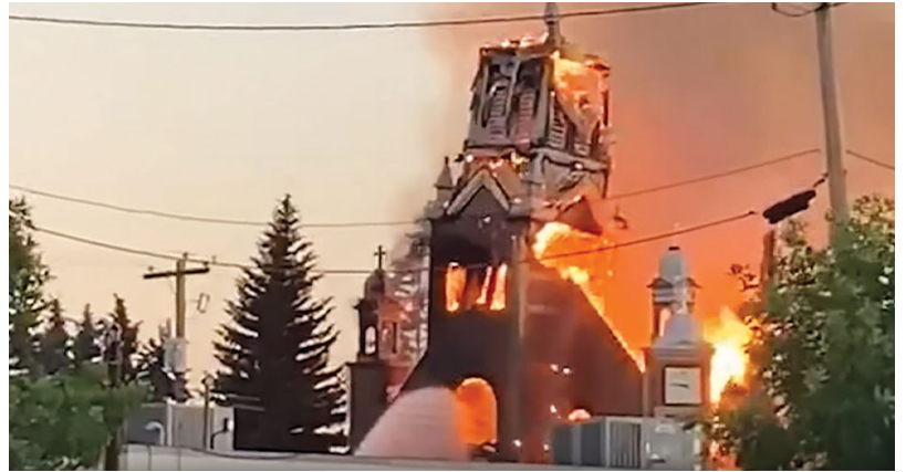
Rebel News Rebel News

“There are not over a hundred people in the United States who hate the Catholic Church,” the late, great Archbishop Fulton J. Sheen stated in 1938. “There are millions, however, who hate what they wrongly believe to be the Catholic Church.” In thus noting, perhaps Sheen was thinking of how the Crusades are cast as imperialistic campaigns when they were more like defensive actions designed to ward off Muslim aggression; or maybe how WWII-era pontiff Pius XII was portrayed as “Hitler’s Pope,” though we now know this is an illusion effected via Soviet agitprop. Or maybe the prelate was pondering 100 other things, from the historical to the theological.