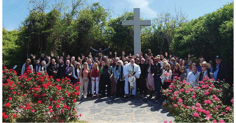
The New American First Landing participants gather at the historic cross at the Cape Henry Memorial.

VIRGINIA BEACH, Va. — Commemorating the covenant invoked by Reverend Robert Hunt when the first English settlers landed in Virginia in late April, 1607, hundreds of God-fearing patriots from across America and beyond gathered in Virginia Beach on April 26 to rededicate the embattled nation to God and beg for His forgiveness. Hundreds of thousands tuned in from all over the United States and across the globe as the event was livestreamed worldwide in 72 languages. But the primary intended audience was made up of just One: the God of Abraham, Isaac, and Jacob — the Creator of the Heavens and the Earth.