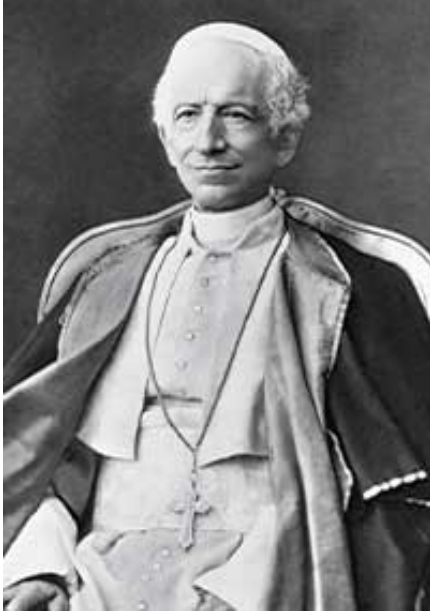
Pope Leo XIII (Public Domain)

“Marriage was not instituted by man, but by God.... When Christianity is rejected, marriage inevitably sinks into the slavery of man’s vile passions.”