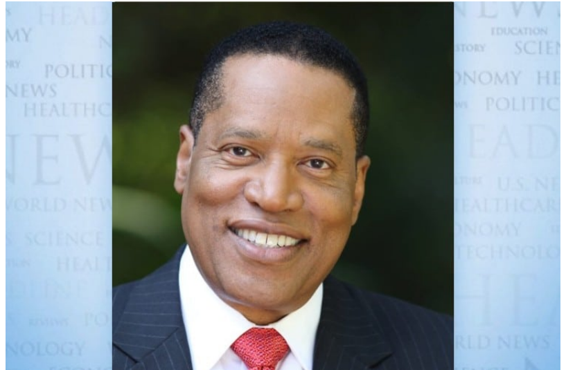
Larry Elder Larry Elder

I did not invite Trump to campaign for or with me. Neither did Youngkin. Like Youngkin, I support school choice, oppose vaccine mandates and am pro-life. Unlike in the Youngkin race, Trump did not publicly endorse me. Still, Newsom described me as “more Trump than Trump.” In Newsom’s