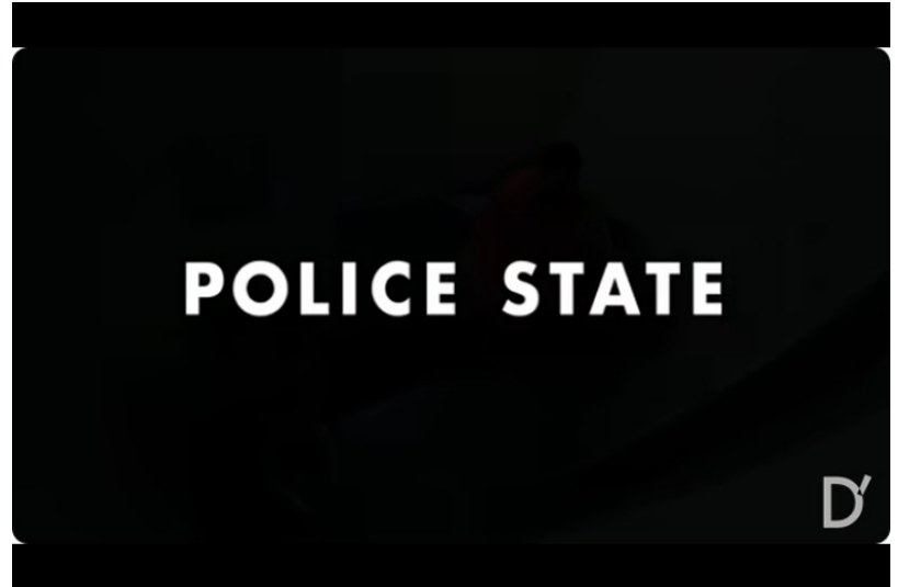
"Police State" trailer

KGB. Gestapo. Stasi. DGI. We all know the names. Every totalitarian regime has its enforcement arm, its dreaded police apparatus. These evil entities exist to strike terror into the hearts of citizens and make them comply with the regime's dictates. Americans have been uniquely blessed not to have a national police force that could be bent in that despotic direction. In establishing our Constitution, the Founders wisely placed police powers in the hands of state and local governments. But that has changed.