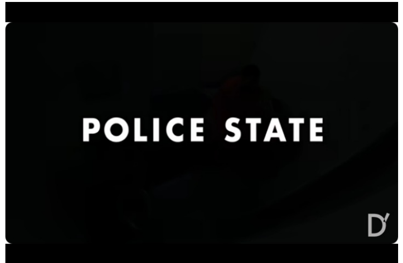
"Police State" trailer

KGB. Gestapo. Stasi. DGI. We all know the names. Every totalitarian regime has its enforcement arm, its dreaded police apparatus. These evil entities exist to strike terror into the hearts of citizens and make them comply with the regime's dictates. Americans have been uniquely blessed not to have a national police force that could be bent in that despotic direction. In establishing our Constitution, the Founders wisely placed police powers in the hands of state and local governments. But that has changed.