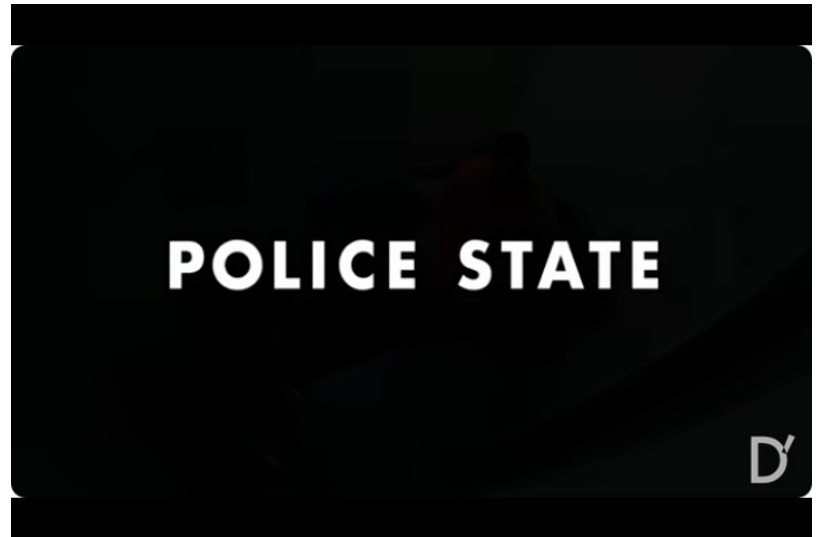
"Police State" trailer

KGB. Gestapo. Stasi. DGI. We all know the names. Every totalitarian regime has its enforcement arm, its dreaded police apparatus. These evil entities exist to strike terror into the hearts of citizens and make them comply with the regime's dictates. Americans have been uniquely blessed not to have a national police force that could be bent in that despotic direction. In establishing our Constitution, the Founders wisely placed police powers in the hands of state and local governments. But that has changed.