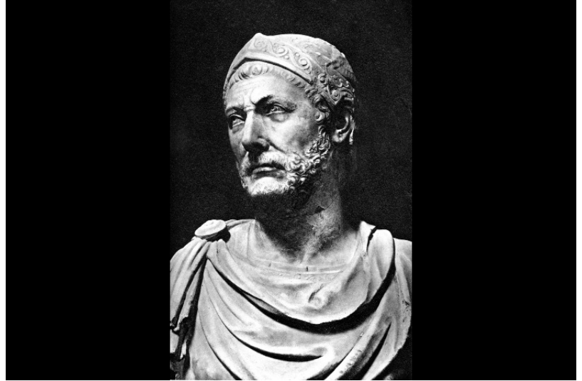
Capuan bust, reputedly of Hannibal

The study of history is the best medicine for a sick mind; for in history you have a record of the infinite variety of human experience plainly set out for all to see; and in that record you can find for yourself and your country both examples and warnings; fine things to take as models, base things, rotten through and through, to avoid.