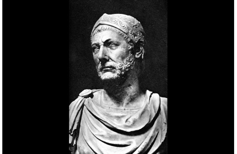
Capuan bust, reputedly of Hannibal

The study of history is the best medicine for a sick mind; for in history you have a record of the infinite variety of human experience plainly set out for all to see; and in that record you can find for yourself and your country both examples and warnings; fine things to take as models, base things, rotten through and through, to avoid.