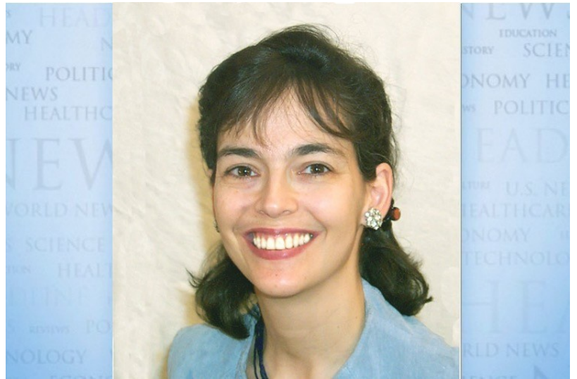
Lenore Skenazy Lenore Skenazy

"Hi Matt! Looking over all the topics on the Reason blog — ever fascinating — I see one that's not covered much: Parenting.... "And yet, I was angry to learn about parents who'd been arrested for letting their kids wait in the car, or walk to the pizza parlor, or play in the park. I couldn't believe some daycare workers had to check in on sleeping babies every 15 minutes to record their sleep positions. I heard from teachers who had to fill out hazardous materials reports for each different brand of baby wipe and dish soap in their classrooms."