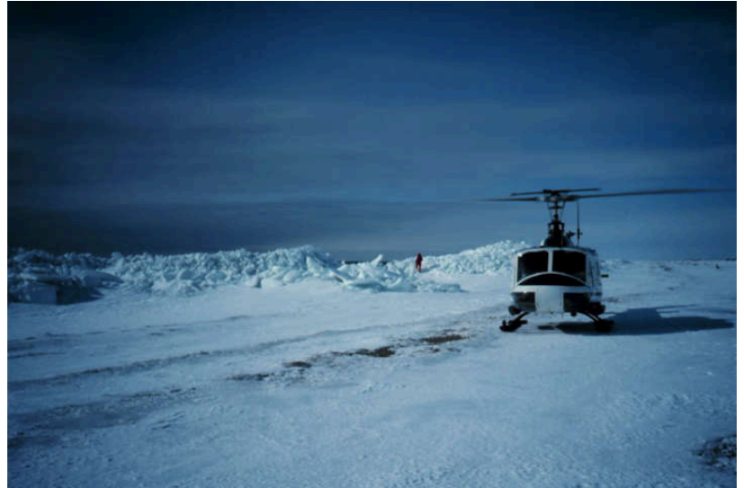
Sea ice piling up on Reindeer Island in Prudhoe Bay area in 1981.

To get people to believe their propaganda, the climate-change elites tell frightening stories and make scary predictions. In the 1970s this meant that climate-change fanatics told stories about the imminent arrival of a new Ice Age. In its April 28 edition of 1975, Newsweek warned of the dangers of a cooling world.