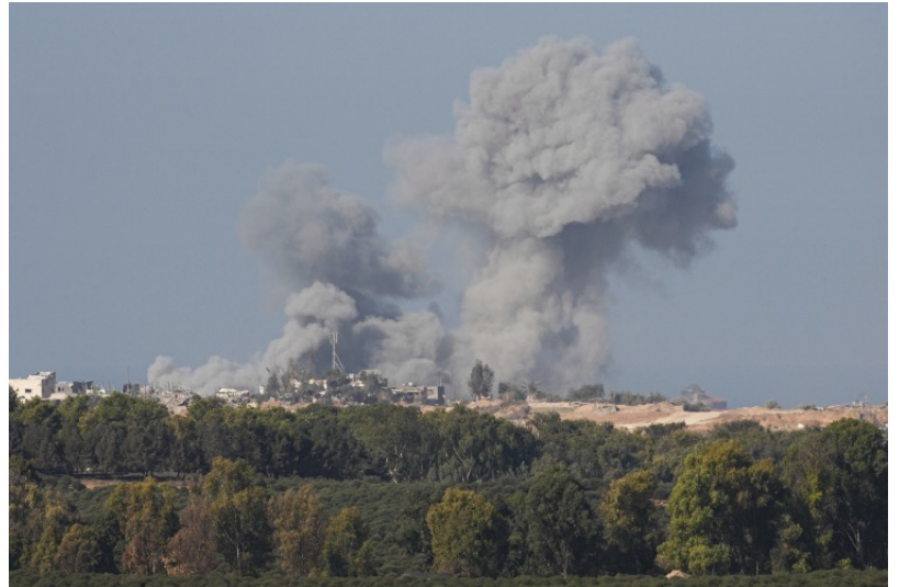
Israeli bombing in Gaza December 4

IDF spokesperson Rear Admiral Daniel Hagari announced, “We have entered a new phase in our war against Hamas.” Israel resumed its military operations on Monday with IDF aircraft bombing 200 Hamas targets, after the cease-fire ended Friday. Reuters reports that Palestinian sources are claiming that at least 50 people have been killed as a result of the airstrikes on schools sheltering refugees from northern Gaza. More than 15,500 Palestinian civilians have been killed during the conflict, with 70 percent being women or minors.