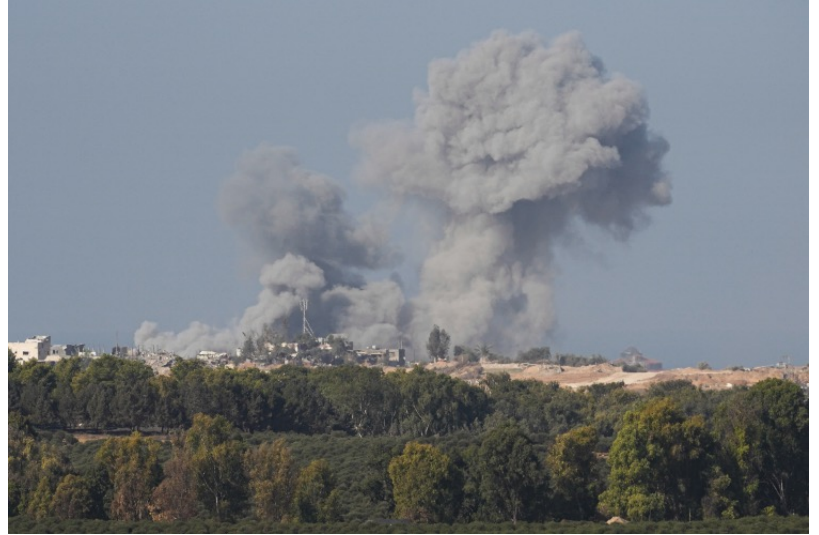
Israeli bombing in Gaza December 4

IDF spokesperson Rear Admiral Daniel Hagari announced, “We have entered a new phase in our war against Hamas.” Israel resumed its military operations on Monday with IDF aircraft bombing 200 Hamas targets, after the cease-fire ended Friday. Reuters reports that Palestinian sources are claiming that at least 50 people have been killed as a result of the airstrikes on schools sheltering refugees from northern Gaza. More than 15,500 Palestinian civilians have been killed during the conflict, with 70 percent being women or minors.