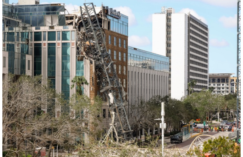
St. Petersburg after Hurricane Milton

To everyone impacted by Hurricane Milton: I urge you stay inside and off the roads. Downed power lines, debris, and road washouts are creating dangerous conditions. Help is on the way, but until it arrives, shelter in place until your local officials say it's safe to go out.