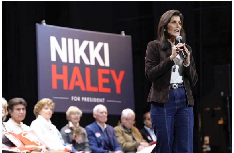
Nikki Haley

Despite trailing in the Republican presidential primary, Haley requested secret-service protection after receiving threats and being the target of hoax emergency calls.