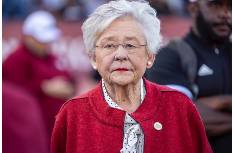
Kay Ivey

The American Civil Liberties Union (ACLU) criticized the new law, stating, “This bill is intended to have a chilling effect on discourse regarding race, class, sexuality, and national origin, and seeks to characterize these discussions and accurate teachings, assignments, and trainings that also supplement them as ‘divisive.’”