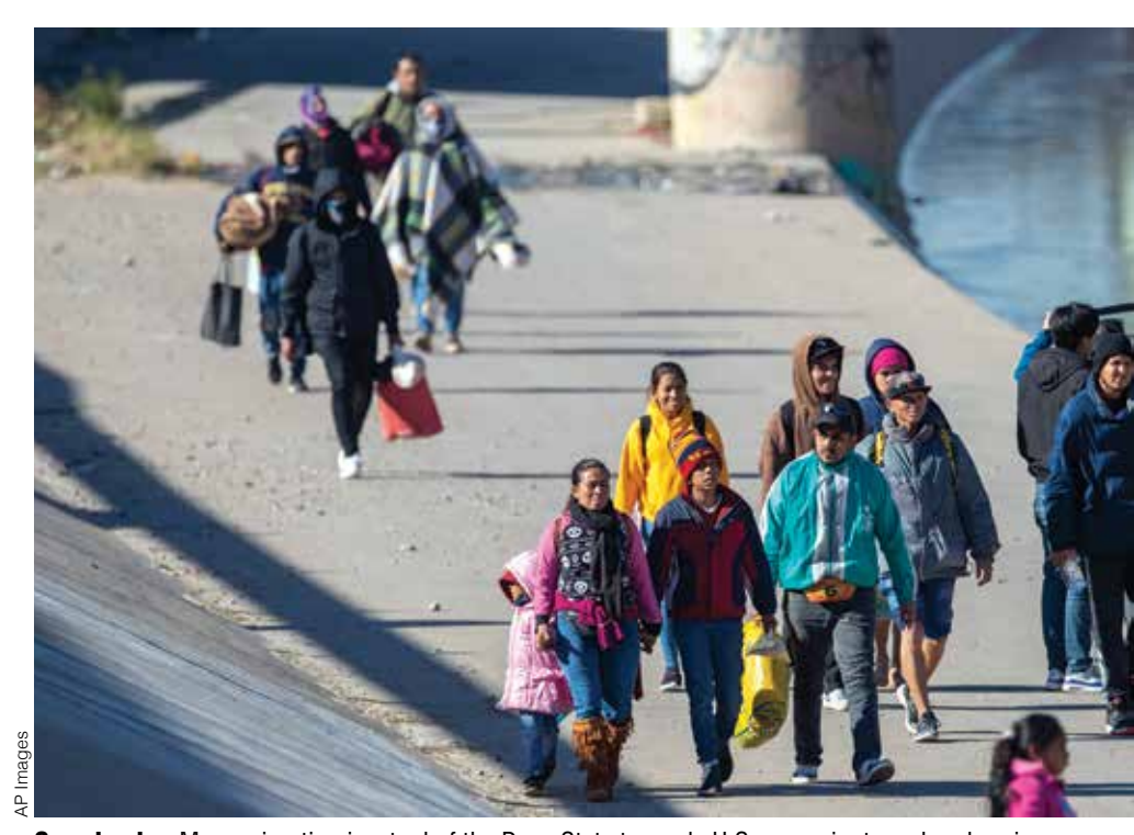
Open border: Mass migration is a tool of the Deep State to erode U.S. sovereignty and undermine the American system of government. Rather than working for secure borders, the State Department is promoting such subversion.

The House rejected Steube's amendment on September 28, 2023 by a vote of