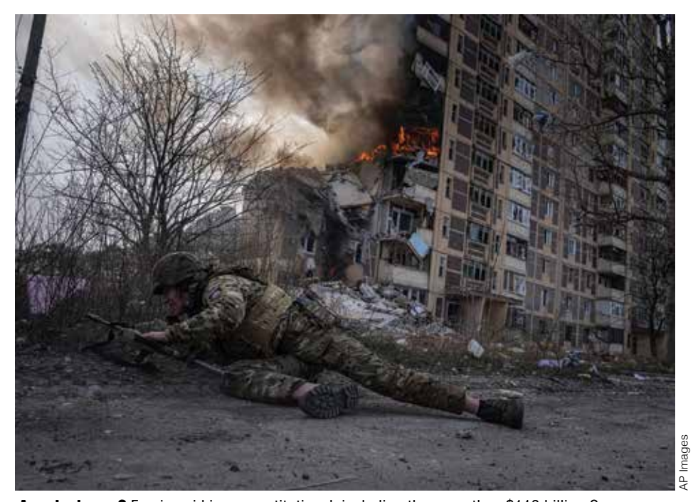
America's war? Foreign aid is unconstitutional, including the more than $113 billion Congress has already appropriated for Ukraine. The House rejected an amendment to prohibit further security assistance to Ukraine.

The House adopted Jackson's amendment on July 13, 2023 by a vote of 221 to 213 (Roll Call 300). We have assigned pluses to the yeas because the right to life is the most fundamental, God-given, and unalienable right asserted in the Declaration of Independence and guaranteed by