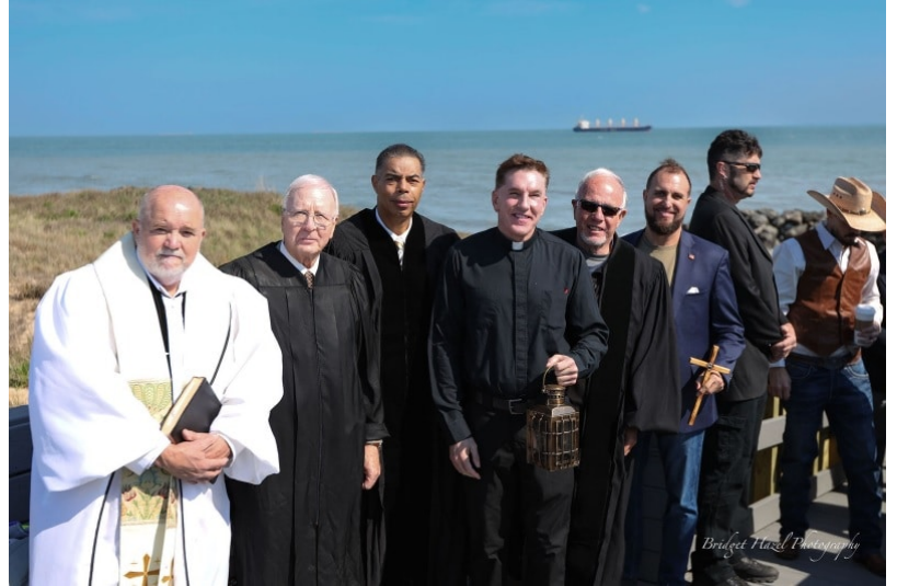
Speakers at the "First Landing 1607 Project"

VIRGINIA BEACH, Va. — Commemorating the covenant invoked by Rev. Robert Hunt when the first English settlers landed in Virginia in late April, 1607, hundreds of God-fearing patriots from across America and beyond gathered in Virginia Beach on April 26 to rededicate the embattled nation to God and beg for His forgiveness. Hundreds of thousands tuned in from all over the United States and across the globe as the event was livestreamed worldwide in 72 languages. But the primary intended audience was made up of just One: The God of Abraham, Isaac, and Jacob — the Creator of the Heavens and the Earth.